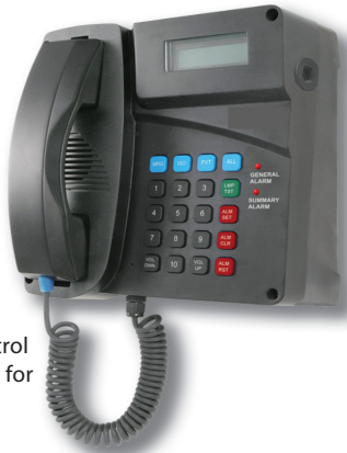
MICON Master Control Station – configured for wall mount