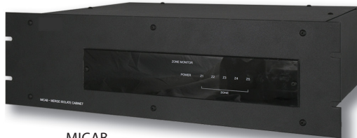
MICAB Merge Isolate Switching Cabinet